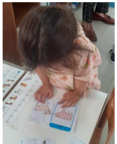
Animals have families too...