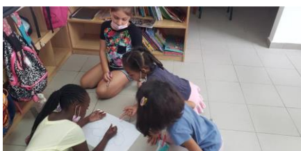
Collaborative work in Milepost 2