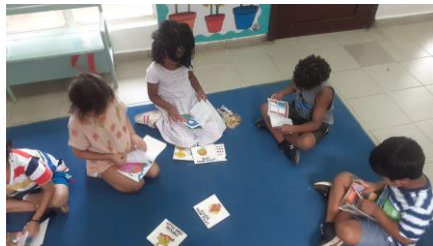
Exploring different characters within families.