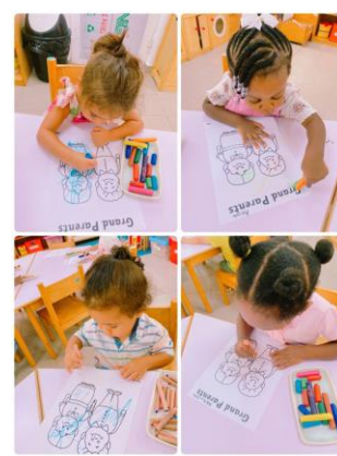
Colouring of people in our extended family.