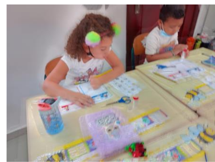
Writing about our likes and dislikes, MP1