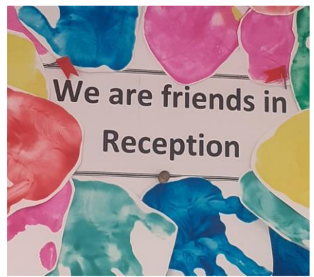
Joining hands in Reception, we are one...