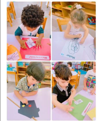
Craft and colouring of people in my family.