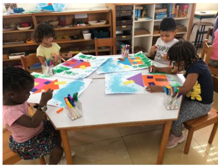
Building a house with 2D shapes