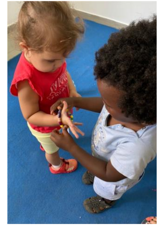
Giving friendship bracelets we made to each other...