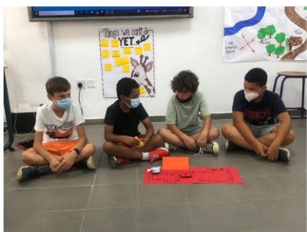
Brainwave trivia game!!!