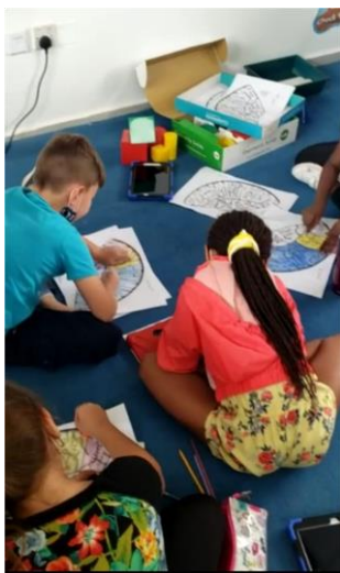
Identifying parts of the brain...interesting!