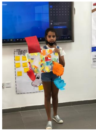
Brain lobes fact pop up poster