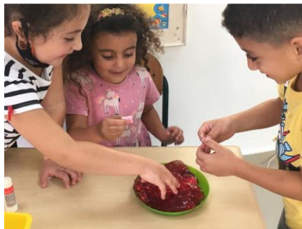
Ooh jelly brains ... exploration!