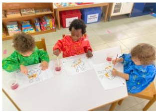
Using water colours to paint a friendship colouring sheet...