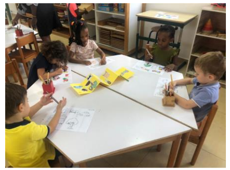
Making an interactive book!