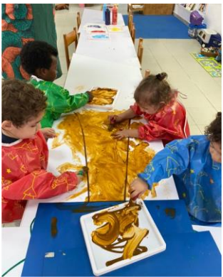
Painting the trunk of our friendship tree...