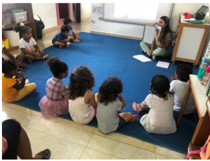
Guess the baby game