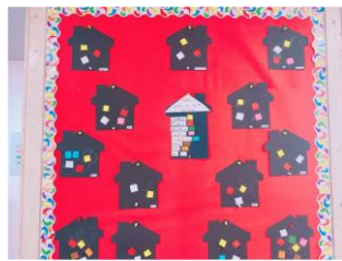
Craft representation of people within my family.