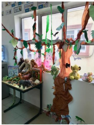
Rainforest Theme just starting...