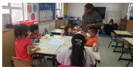
Brainwave Unit was a blast