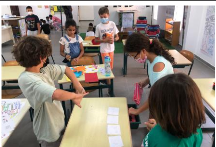
"Exploring the memory" games