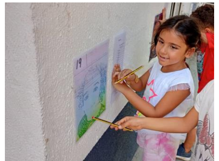
Children identified distorted portraits of themselves.